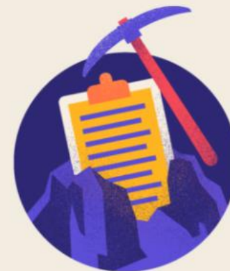
DATA COLLECTION & SOURCING